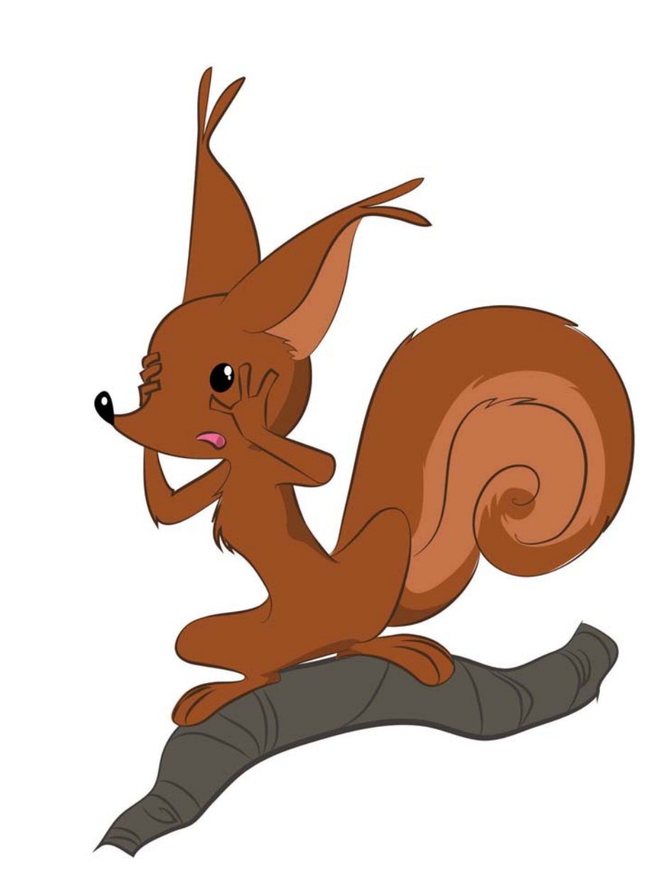
'I can help!' 'My hand! My finger!'